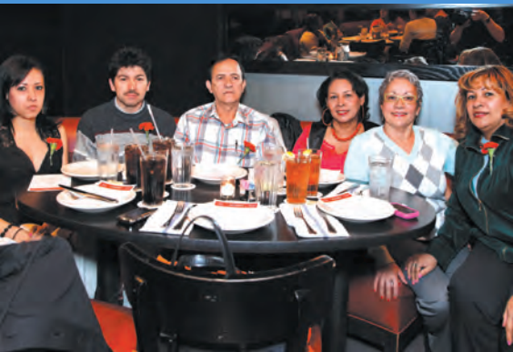
Above: Celebrating NAC Parents